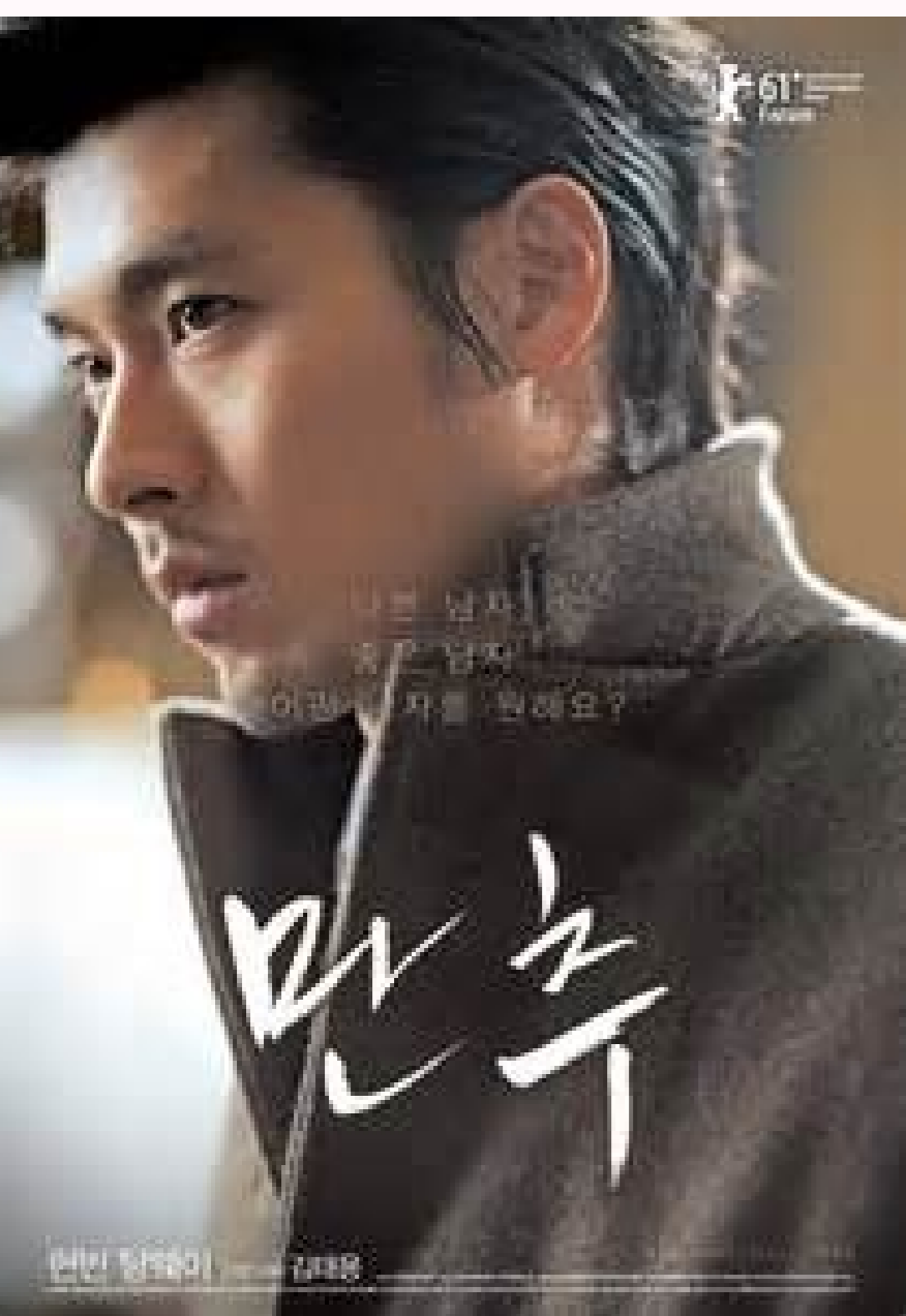
Yuntum marathi movie free download.